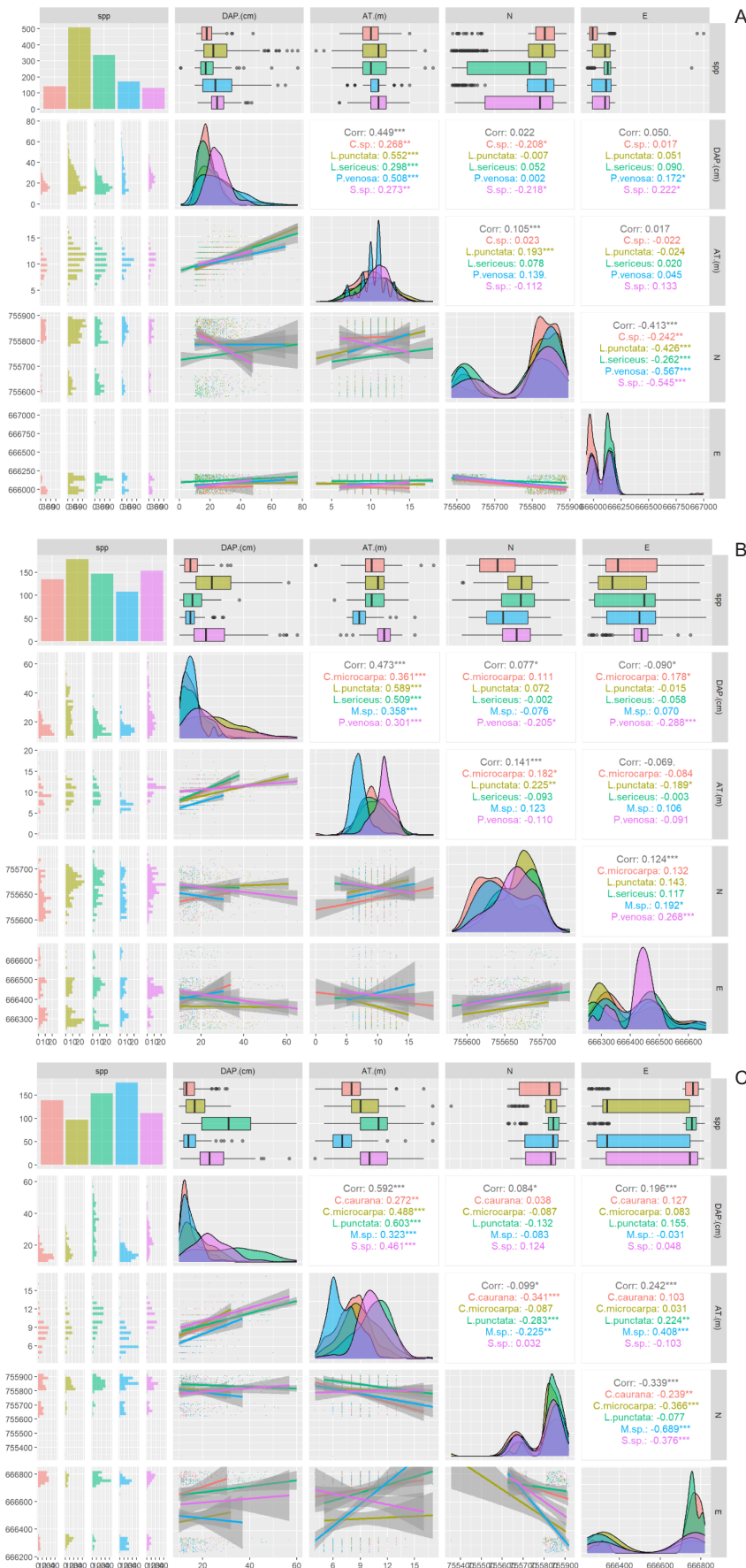
Figure 3.- Boxplot, histograms, Pearson's correlation coefficient and dispersion plots, of the floristic composition of forests by physiographic units: A) Summit, B) Slope, C) Base. El Dorado – Tumeremo, Bolívar, Venezuela. Note: spp: species; DAP: diameter at breast height (DBH in cm); AT: total height; N: north coordinate; E: east coordinate; C. sp.: Calliandra sp.; C. microcarpa: Chimarrhis macrocarpa ; C. caucarana: Coccoloba caucarana ; L. punctata: Lepidocordia punctata ; L. sericeus: Lonchocarpus sericeus ; M. sp.: Myrcia sp.; P. venosa: Peltogyne venosa ; S sp.: Sloanea sp