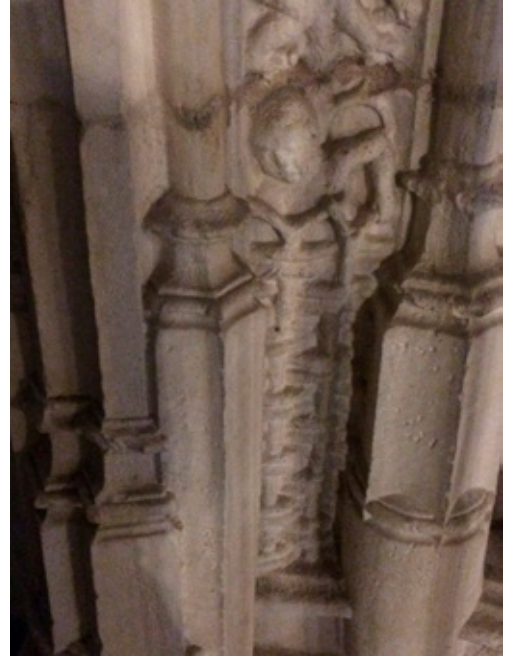
Fig. 8. Decoration of the entrance arch, "Ribadeneira" chapel, church of San Justo y Pastor, Toledo. Chapel completed in the late fifteenth/early sixteenth century.