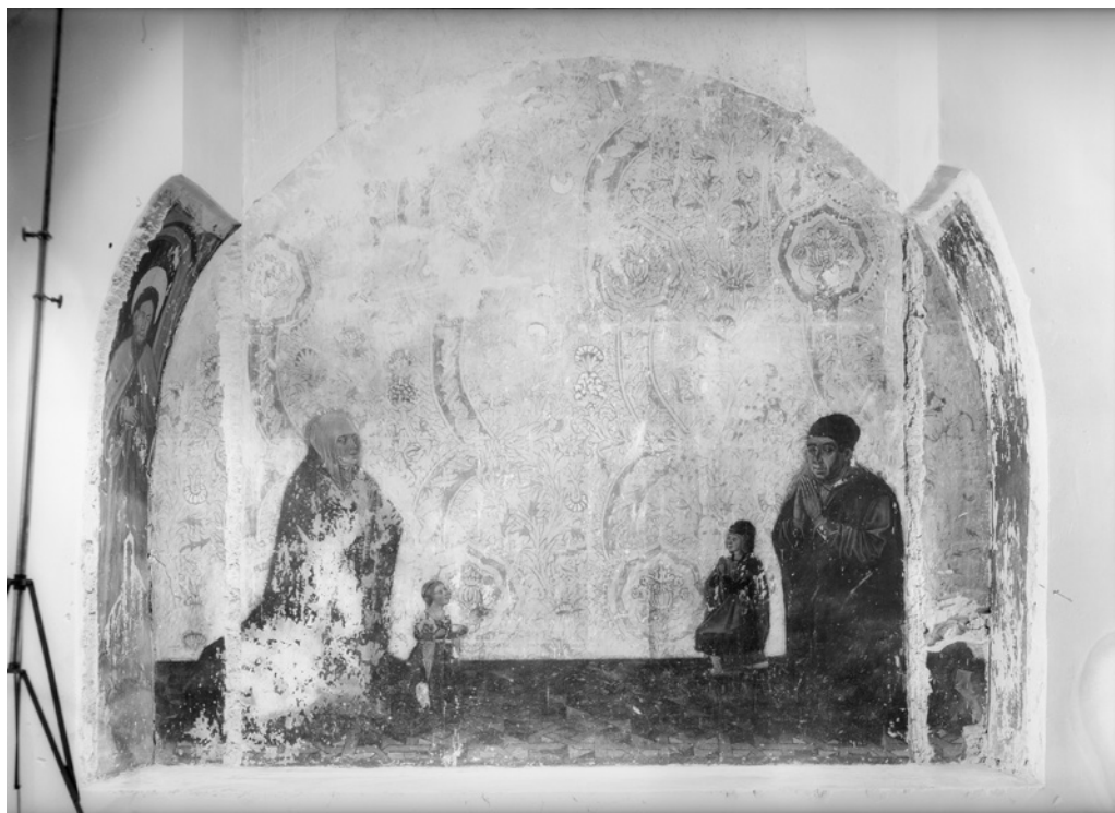
© 2019 Institut Amatller d'Art Hispànic - im. 05557033 (foto Mas C-79832 / 1934)