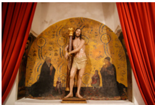
Fig. 5. Sculpture of Christ at the Column and wall painting, Candelaria chapel, church of San Justo y Pastor, Toledo. Chapel completed by 1497.

figures usually identified as Guas and his family at the centre (fig. 5). Two adults and two children kneel in a fictive space, in front of a richly embroidered cloth which extends far above their heads. Today, they seem to gaze at the wooden statue of Christ at the Column, which stands in front of the mural painting. Recorded elsewhere in the church in the early twentieth century, this sculpture can be dated stylistically to the late fifteenth or early sixteenth century, in spite of its later polychromy. Moreover, its iconography relates to the chapel's original dedication to Christ at the Column, recorded in fifteenth-century documents, and so it has been suggested that it was always intended to decorate Guas' chapel and even that it was carved by Guas, although these assumptions are unverified. 22 This space has evidently undergone several large-scale transformations since its first construction. In order to recreate a sense of the space as it once existed in Guas' time, we must first interrogate the surviving documents related to the chapel.