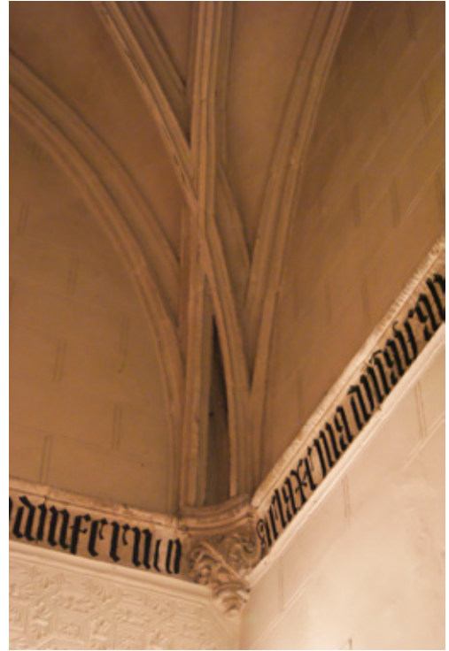
Fig. 4. Corbel and vault ribs, south west corner, Candelaria chapel, church of San Justo y Pastor, Toledo. Chapel completed by 1497.

Guas' chapel preserved its gothic design through these alterations, yet major repairs to roof and floors and small changes to the decoration of the altar are documented from 1603 to 1606. 17 The tombs or funerary slabs, which probably once decorated the sides or floor of the chapel, may have been removed during these, or later, transformations. An artillery shell in 1936 caused more dramatic damage. 18 Nevertheless, by this point, the chapel's appearance and contents had been recorded by such early art historians as Ramón Sixto Parro, José and Rodrigo Amador de los Ríos and Rafael Ramírez de Arellano, offering some degree of assurance as to the space's overall design. 19