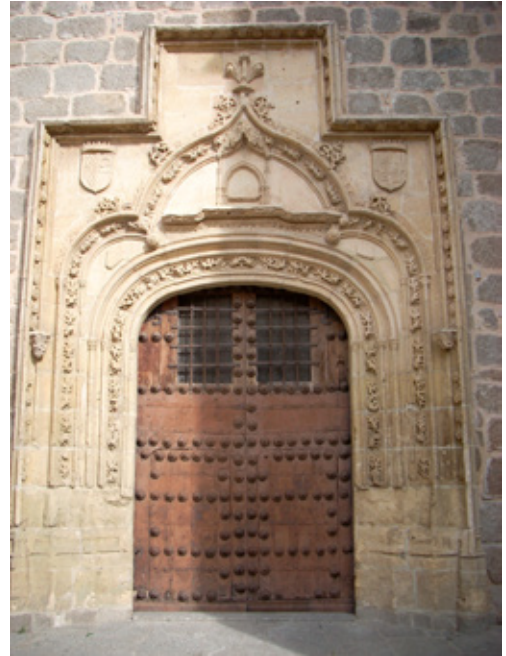
Fig. 14. Portal, church of the Assumption, Colmenar Viejo, early sixteenth century.

Unlike cathedrals and parish churches, the space of San Juan de los Reyes seems to have been completely reserved for the celebration of Ferdinand and Isabella's political and military successes. High-ranking, trusted royal officials were buried in the convent, notably Pedro de Ayala, a bishop and royal ambassador to Scotland and England whose tomb still survives in the conventual church, and Hernán Núñez Arnalte —treasurer to Isabella as princess and then to the Catholic Monarchs— whose corpse was deposited in San Juan de los Reyes between his death in 1480 and its translation to Santo Tomás in Ávila in 1500. 63 In spite of the temporary or permanent burials of such royal officials, the convent's decoration is essentially based on the countless repetition of royal coats of arms and other royal insignia. A probably apocryphal but highly significant anecdote related in the Libro Becerro of the Charterhouse