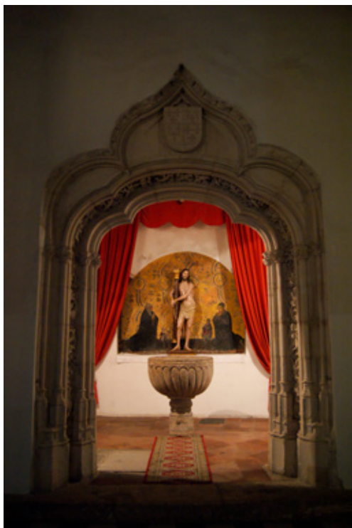
Fig. 15. Doorway and interior of the Candelaria chapel, church of San Justo y Pastor, Toledo. Chapel completed by 1497.