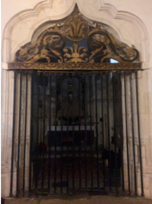
Fig. 7. "Ribadeneira" chapel, church of San Justo y Pastor, Toledo. Chapel completed in the late fifteenth or early sixteenth century.