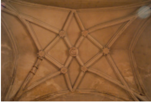
Fig. 3. Vault of the Candelaria chapel, church of San Justo y Pastor, Toledo. Chapel completed by 1497.

brick structure so typical of Toledo, must be the earlier part of the building and may pre-date the large-scale reconstruction patronised by Gonzalo Ruiz de Toledo, lord of Orgaz, in the first half of the fourteenth century, when the richly decorated chapel of Corpus Christi was probably constructed. Three gothic chapels were added to the church's south side in the late fifteenth to mid-sixteenth century: the westernmost is Guas'; the second was probably that created by Pedro de Ribadeneira at the same time; the third was established in 1537 by Luis de Arévalo el Viejo and later passed to the Daza family. Drastic changes were introduced in the appearance of the church in the following century, when Juan Bautista Monegro directed the Classicising refashioning of the nave. A Baroque plaster decoration and other transformations followed in the mid-eighteenth century. 16