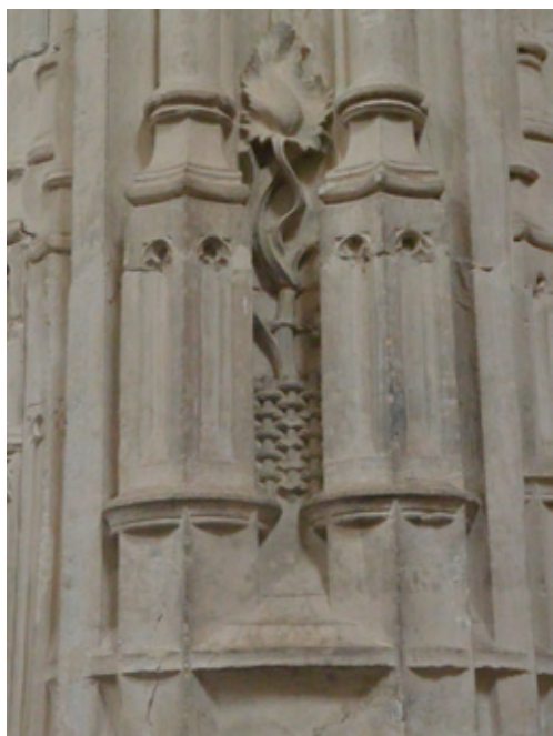
Fig. 9. Decoration of a nave pillar, convent of San Juan de los Reyes, Toledo. Begun 1477, east end completed by 1495.