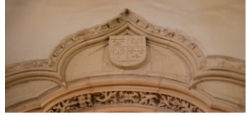
Fig. 2. Coat of arms decorating the entrance of the Candelaria chapel, church of San Justo y Pastor, Toledo. Chapel completed by 1497.

As we were recording the chapels of the right nave, less damaged by the [church’s] restoration, our attention was captured by that of the Candelaria, not for its extremely unattractive, if Renaissance, altarpiece, but rather for the figure of a kneeling man, wearing a dress with cloak and dagger; and