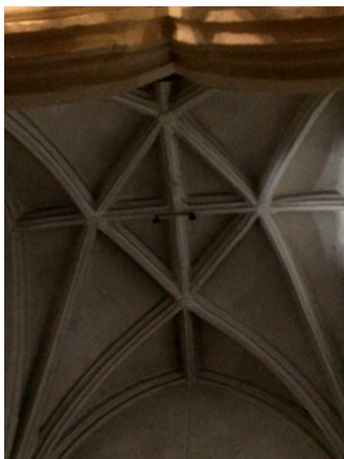
Fig. 10. Vault of the "Ribadeneira" chapel, church of San Justo y Pastor, Toledo. Chapel completed in the late fifteenth/early sixteenth century.